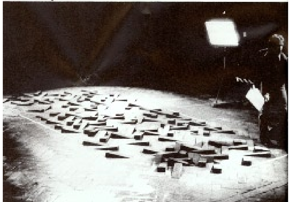
'Floor' Videotape 1980